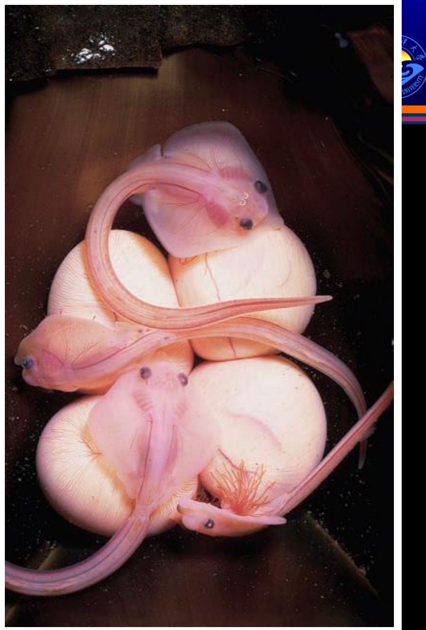
College of Marine Sciences, Shanghai Ocean University